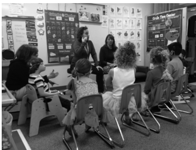
A teacher cues to students in a D/HH program in ISD 917, Minnesota

The ISD 917 program's teachers of D/HH repeatedly expressed over the years the profound relief and freedom in being able to use general education curriculum without having to make