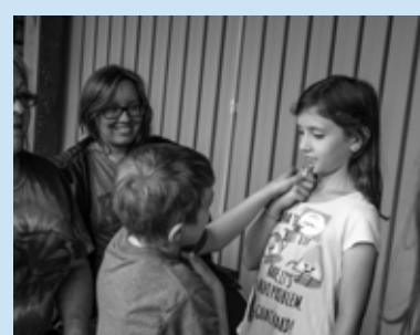
A young camper shows another camper the chin placement.