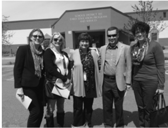
NCSA board members visit a D/HH program in ISD 917

Our program did just that, sending a contingency of D/HH program staff members to Chicago in 1996 to visit both the AG Bell Montessori School where learners were immersed in cued English, and also the large public school for the Deaf, which was implementing the use of Cued Speech in only those classrooms where individual teachers volunteered to learn and use it.