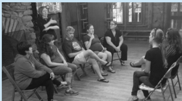
Adult deaf cuers participate in a panel discussion.