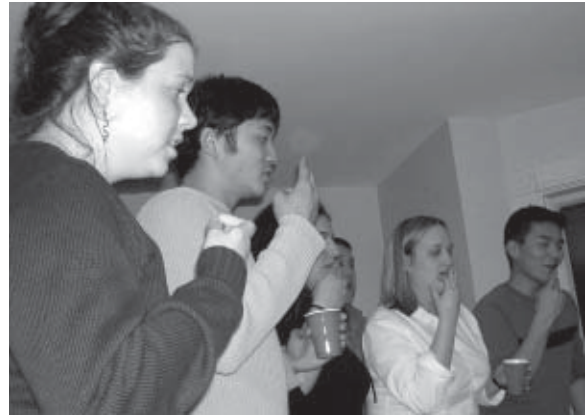
Intense cueing to karaoke!